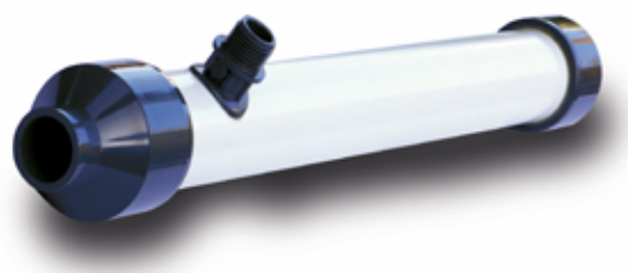
Figure 1: ZW700B-225