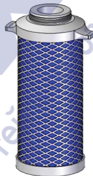
Depth filter VX