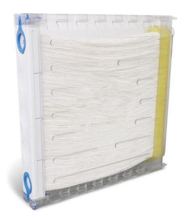
Figure 1: ZeeWeed 1000 module